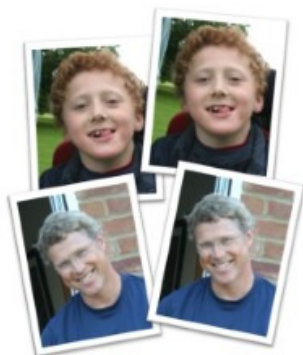
Photo Pelmanism (matching pairs)

Family Photos Go through your photo album and find photographs of family members. Find 2 of each member. If some pairs are identical, great. If others are of someone taken at different times, it doesn't matter as long as your child can recognise the family member in both photos. It helps if all the photographs are of roughly the same size and shape, but this is not essential. Then use the photographs in the same way as you would if playing any matching pairs game. Turn them upside down and take it in turns to lift up a photograph and look at it. Say the name of the person in the photograph. Then pick up another and again say the name of the person pictured. If both photographs are of the same person, the player makes a pair and then repeats his go. If not, place both photographs back on the table upside down and another person takes a turn.