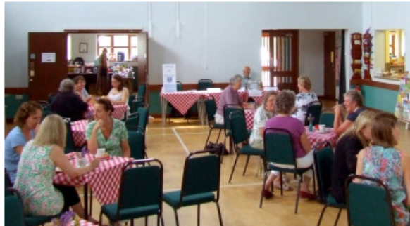
Families enjoying Fledglings coffee morning.

We hope to develop a Focus Group of local families who we can meet with periodically to discuss families' needs and new products we have found to meet them. If you live relatively close to our offices and would be interested in being involved, please let us know.