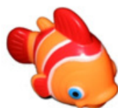
Squirty Bath Fish