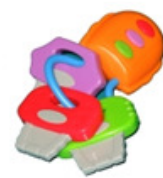
Sound Key Ring