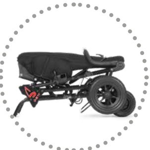
Small folding size (even size 2) -Especially quick and easy to fold with a flick of the wrist.