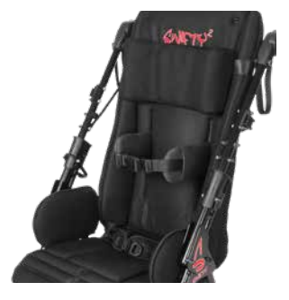
Head pillow, lateral trunk support with chest belt and 2-point pelvic harness (shown on size 2)