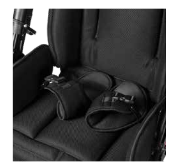
Soft pelvic harness (shown on size 2)