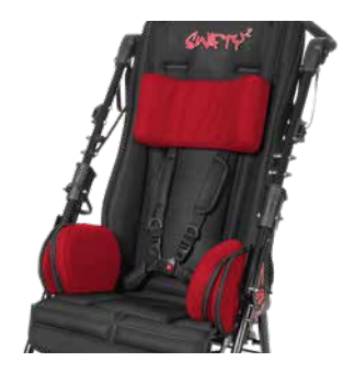
Seat minimizer, available in black and red (red only for size 2 as shown)

You will find the total overview of all accessories in the order form or on our website: www.thomashilfen.com