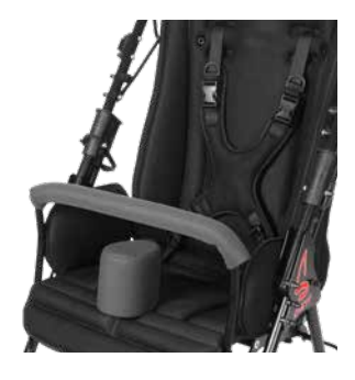
Butterfly chest harness (flexible), abduction block and grip rail (shown on size 2)