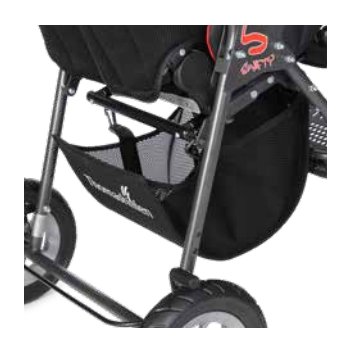
Basket (shown on size 1)