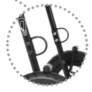
Transit tie-down-kit for safe transport in a vehicle (available for both sizes, standard for size 2)