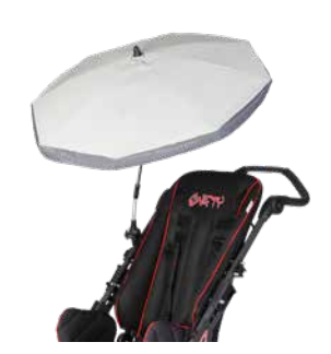
Umbrella and frame padding (shown on size 1)