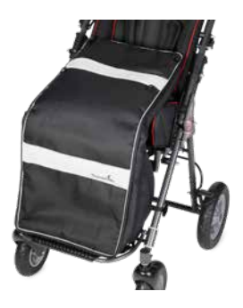
Sleeping bag, padded (summer) or woven fur (winter) (shown on size 1)